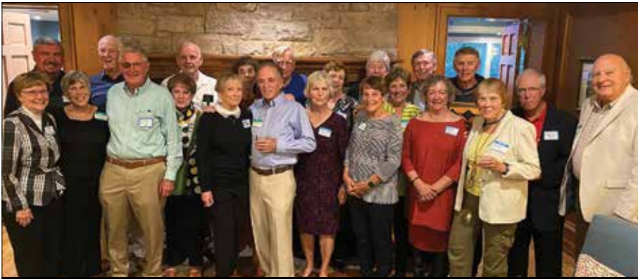
The Class of 1960 celebrated their "60 plus 1" reunion in October!

See Updated Reunion information edgewoodhs.org/alumni/reunions | ehsalumni@edgewoodhs.org