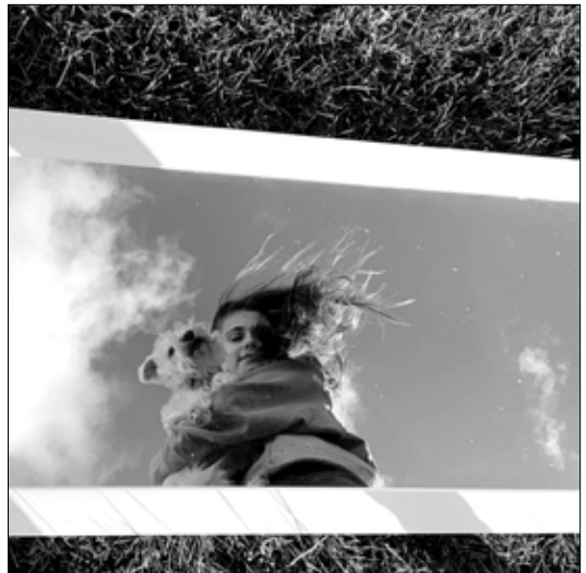
Windy Day Silver Key Award